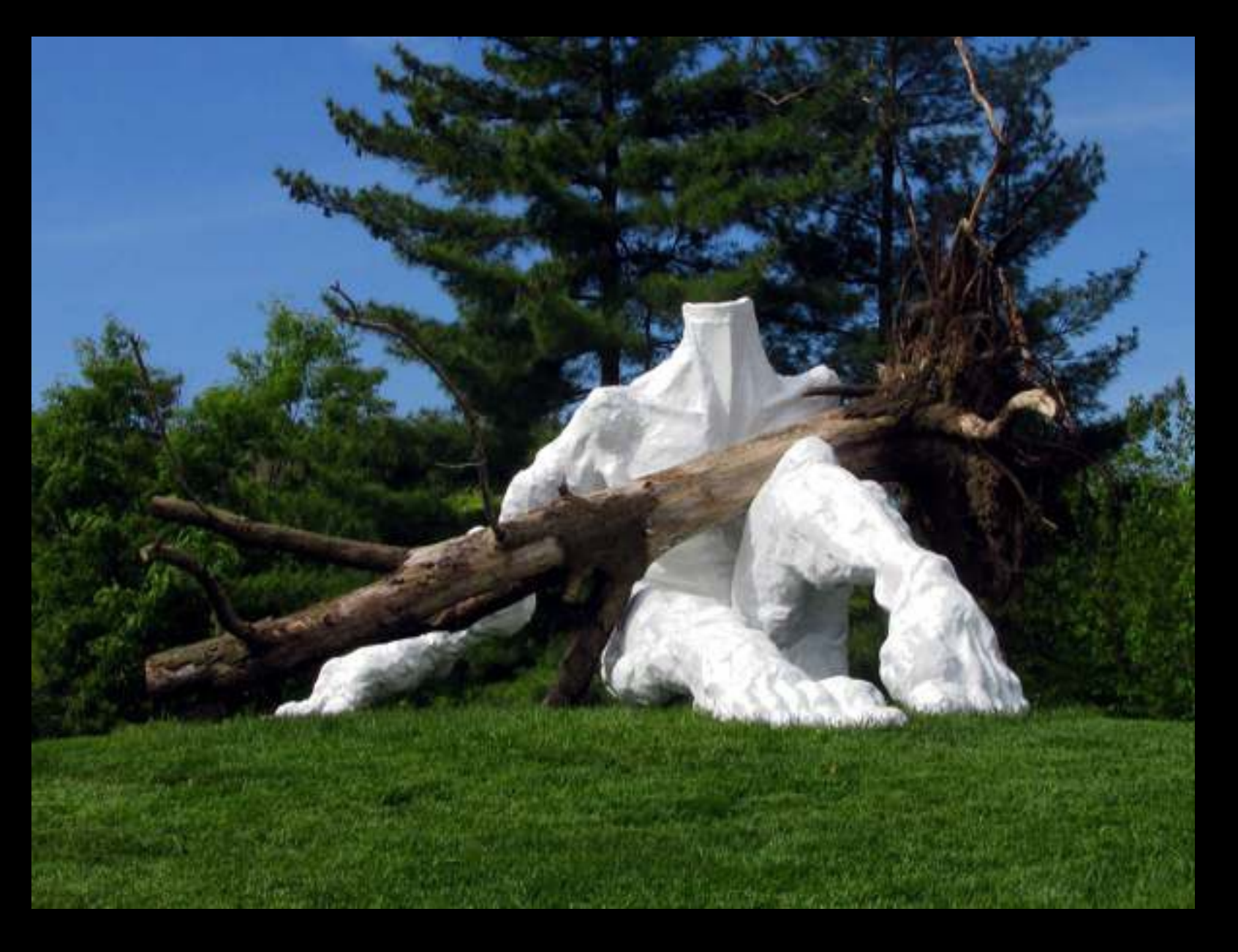
St.Louise, USA 2017